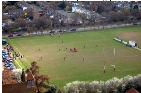
from a helicopter while the 1 st XV beat Ipswich 19-18

Important to remember the new facility will be built & ready for us to play on before we leave Ram Gorse. This will all take time but it's a great breakthrough for us as now we will be in a much better position to get planning permission.